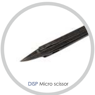
DISP Micro scissor