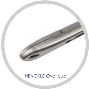
HENCKLE Oval cup