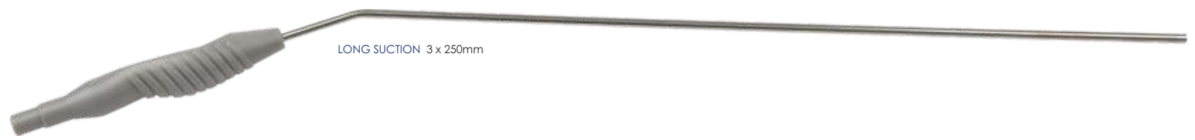
LONG SUCTION 3 x 250mm