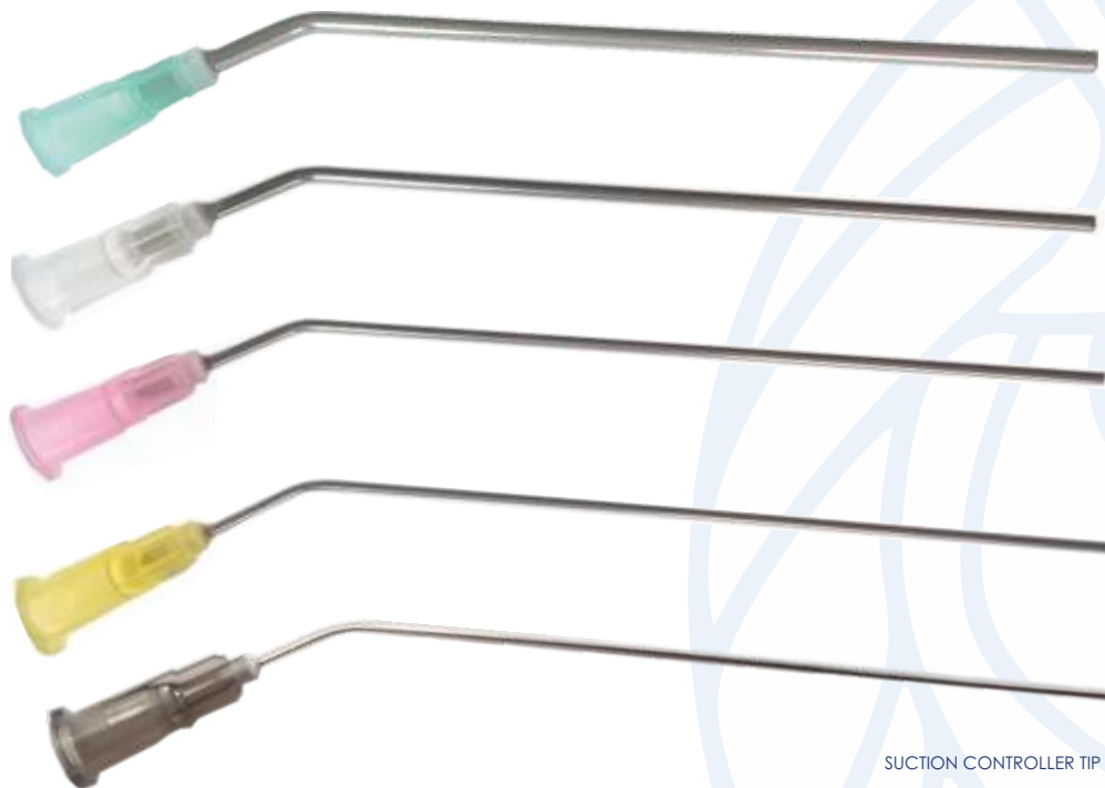
SUCTION CONTROLLER TIP