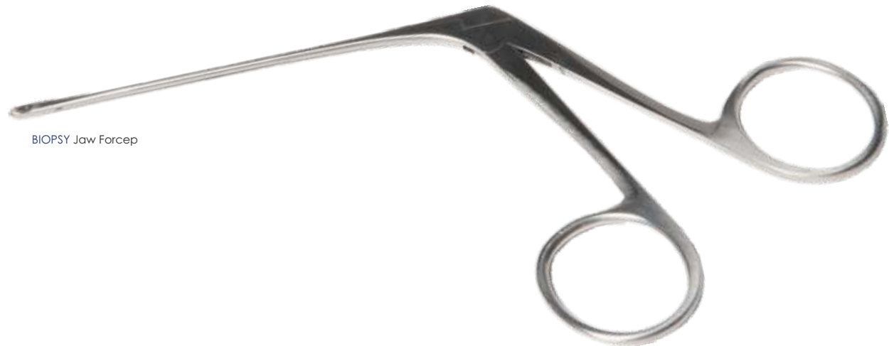
BIOPSY Jaw Forcep